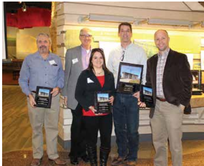
Kansas Chapter – ACI High-Rise Award, Embassy Suites Hotel and Conference Center