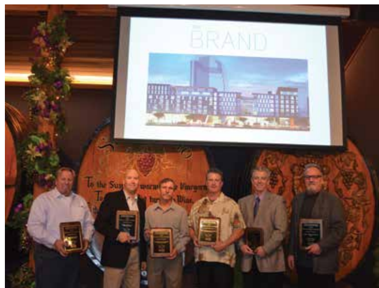
Representatives of Brand + Wilson, winner of the 2015 Outstanding Achievement and Excellence in Concrete Construction Award from the Southern California Chapter – ACI