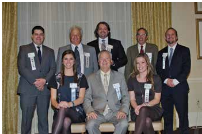
2016 Louisiana Chapter – ACI Board at the 18th Annual Awards Banquet