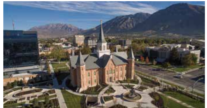
Provo City Center Temple