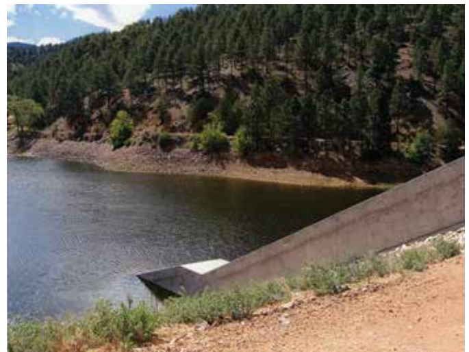
Nichols Dam Intake Structure Replacement