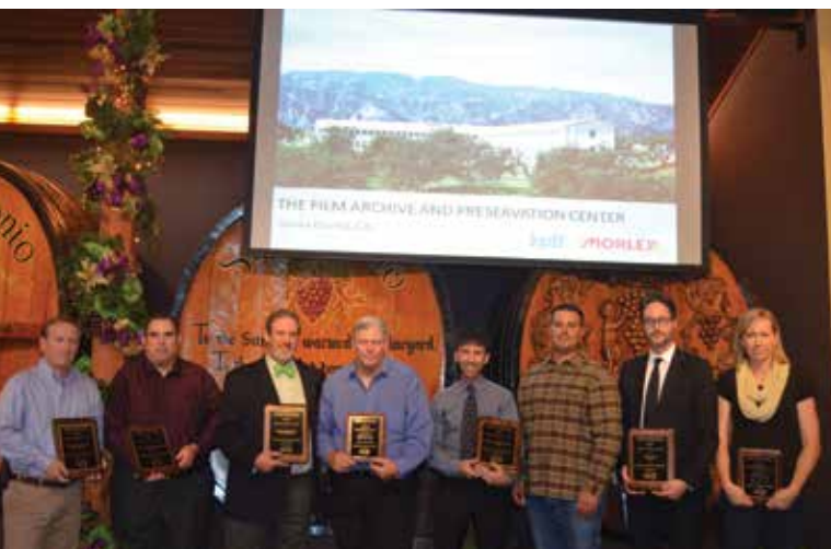
Representatives of the Film Archive and Preservation Center, 2015 Recipient of the Charles J. Pankow, Jr. Award from the Southern California Chapter – ACI

The 2016 Pankow Awards event will take place on November 17, 2016. Learn more about the Southern California Chapter – ACI at www.socal.org .