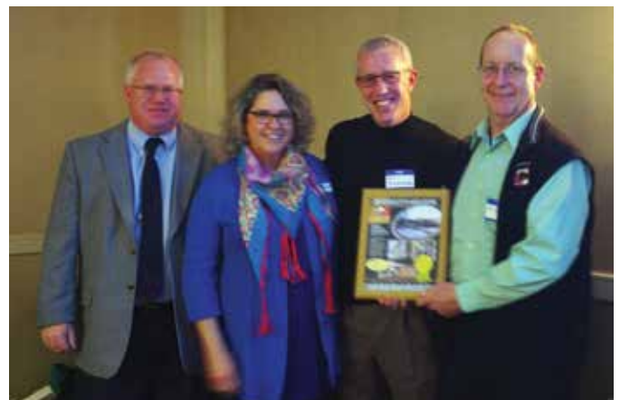
State University Construction Fund won the Central New York Chapter – ACI Masonry Project Gold Award