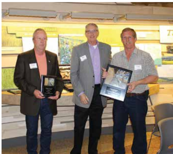
Kansas Chapter – ACI Judges Award, Rammed Earth Walls

Learn more about the Louisiana Chapter – ACI at www.acilouisiana.org .