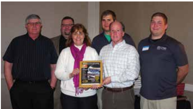
Onondaga County won the Central New York Chapter – ACI Concrete Project Gold Award